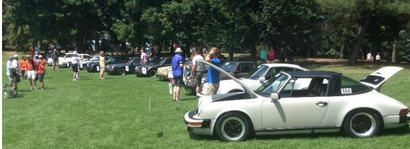
The 911 class.

The Concours field was beautifully filled with Porsches, I had a great time, and learned much more than I expected.